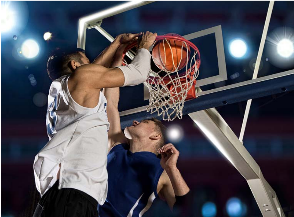
Building a portfolio is a lot like building a basketball team. Each player brings a different attribute.